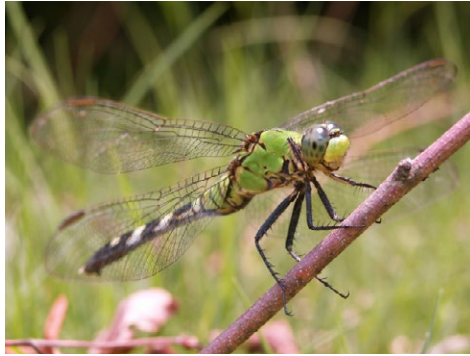
Photo courtesy of (Gilliamhome's Olympus E3 and Evolt 500 Page @flickr.com) - Granted under the creative commons licence- attribution

Fact: Dragonflies have been around for around 300 million years.